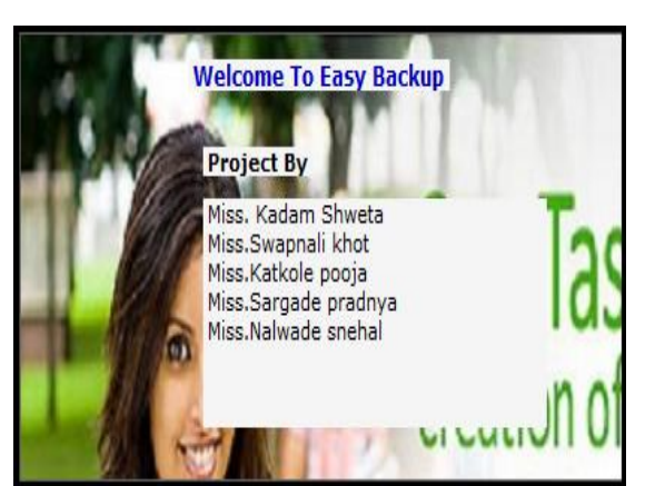
Fig2.First splash screen is open.