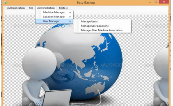
fig3. Main Backup Form.